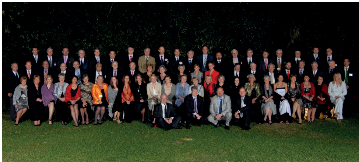
Buenos Aires AGM 2008