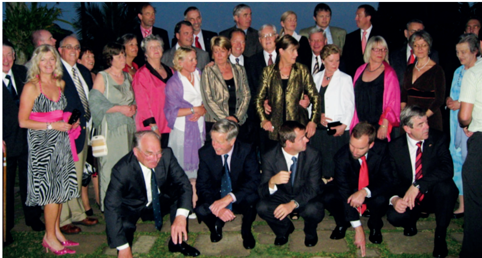
Durban AGM 2009