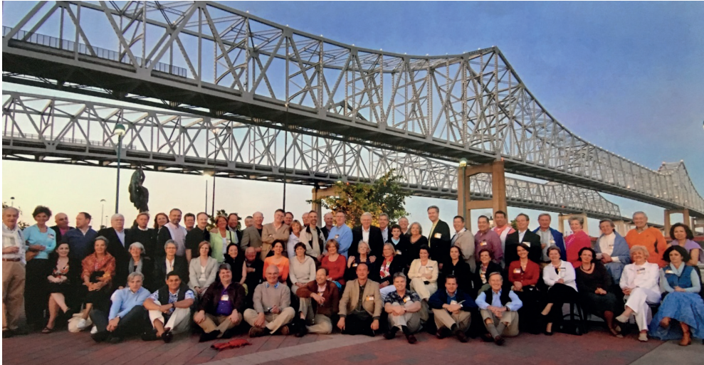
New Orleans 2007

The New York Members Meeting and Working Lunch moved to the iconic surroundings of the New York Yacht Club.