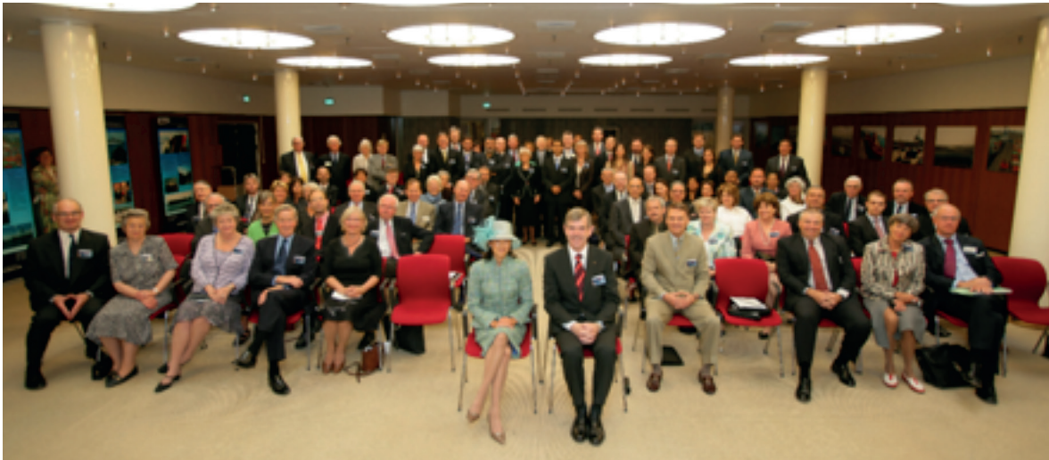
Copenhagen AGM 2006

The concluding dinner was held at the old Royal Shooting Club at Sølyst on the shore of the Öresund. Everyone enjoyed a fine firework display after a very fine dinner during which they were entertained by a magician with some amazing card tricks that are still wondered at today!